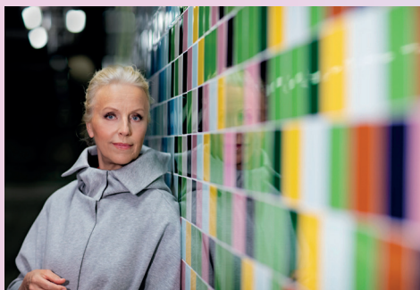
Anne Sofie von Otter